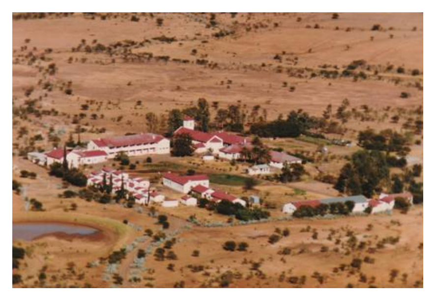
Figure 2: Lumko in the early 1980s—a photo taken from the mountainside above Lumko, looking a bit north of west. The line of trees and bushes in the top left quarter shows the path of the Cacadu River, seldom more than a trickle, and the line of bushes running from the right edge of the photo to the Cacadu is the Ngqoko River (if one could call it that). It runs down from Ngqoko village—when it has some water in it to run, after heavy rain.