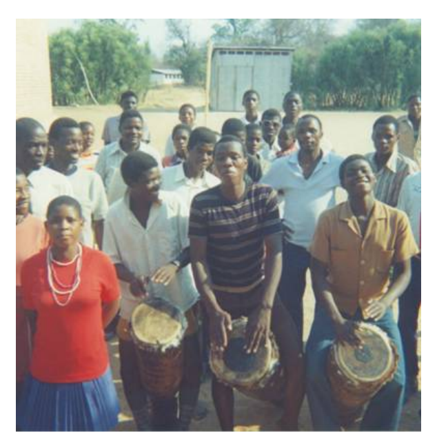
Figure 5 : Andara, eastern Kavango, 1988: A typical Kavango Workshop Group (but much smaller than the Bunya Group); note the typical set of three drums, large, middle size and small.

back the group. By the time I had to leave for the next mission at midday the following day I had recorded a complete new song mass in ruKwangali, with extra songs—13 compositions in all. All used authentic Kavango rhythm techniques; all used call-and-response form; some used Afro-diatonic scale and harmony; but a number of the songs used different traditional Kanago bow scales and harmony.<sup>9</sup>